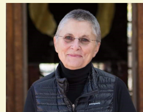
Roshi Joan Halifax

Integrity and Moral Resilience in a Time of Suffering